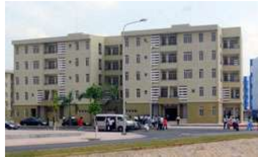
The Vinh Loc B resettlement housing project in Binh Chanh District, HCM City. The Department of Construction blamed deterioration in resettlement housing on inadequate maintenance and poor construction.

The department said that in some places this agreement had expired.